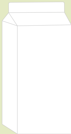
1/2 GAL / 1.89L