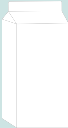
½ GAL / 1.89L