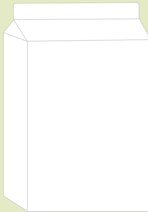
GAL / 3.79L