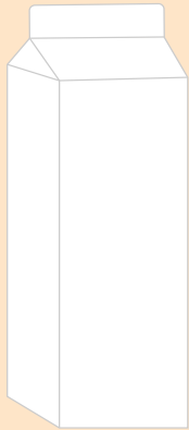
QT / 946 ML