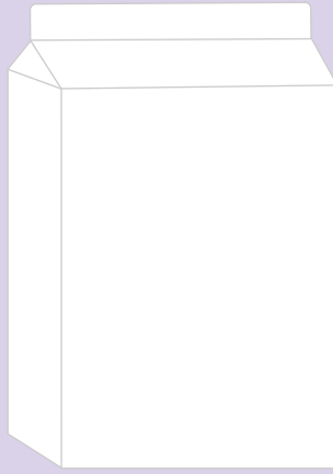
GAL / 3.79L